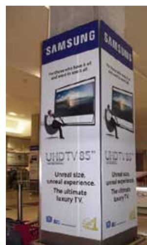
Indoor Pillar Wraps