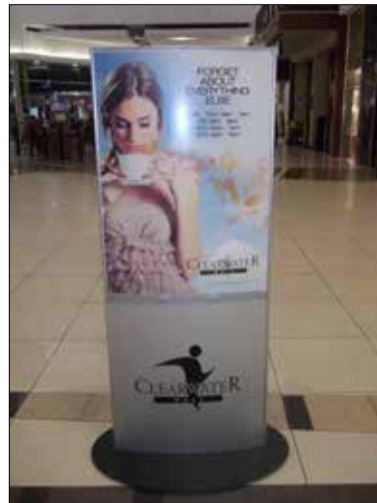
A1 Posters Frames