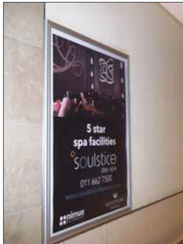
A1 Passage Posters