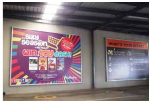
Parking Area Billboards