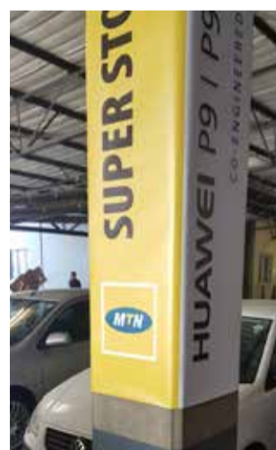
Parking Area Pillar Wraps