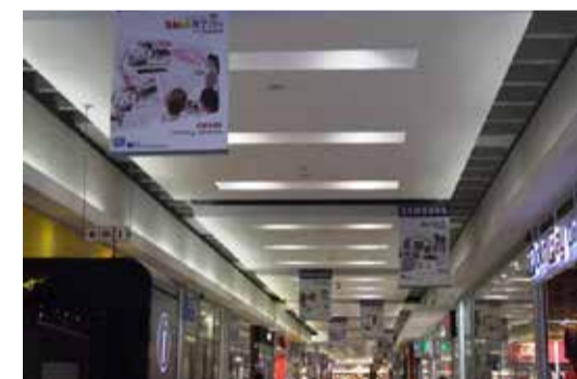
Indoor Hanging Banners