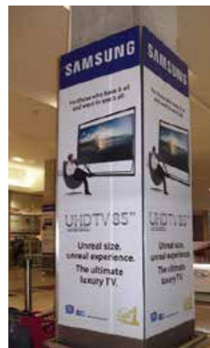
Indoor Pillar Wraps