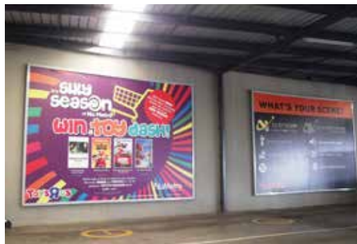
Parking Area Billboards