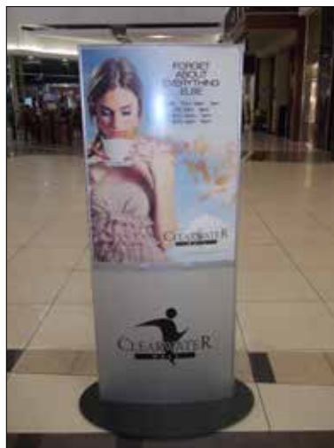
A1 Posters Frames