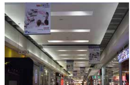
Indoor Hanging Banners