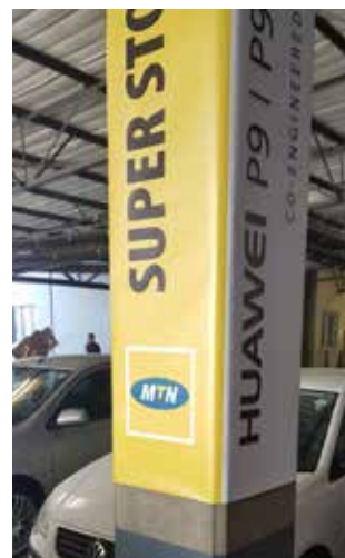
Parking Area Pillar Wraps