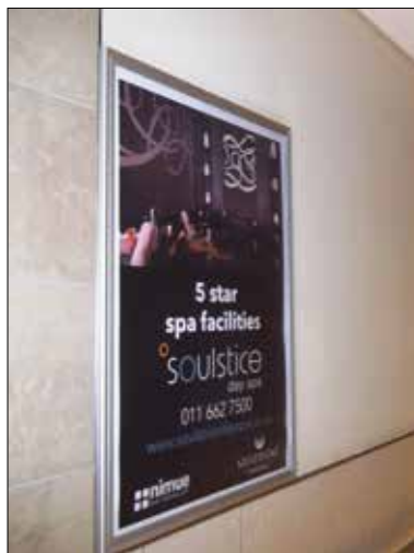
A1 Passage Posters